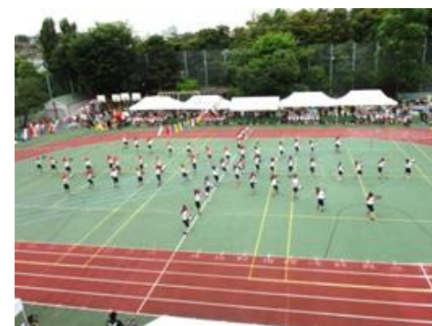
G3,4 “ Jiitubido-I Ninjukuduchi ”