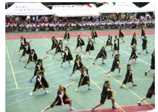
G5,6 “ Nansho Soran ”