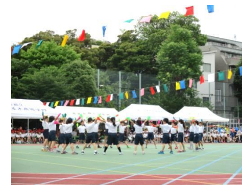
G1 “☆ Minna de Naminamina ☆”