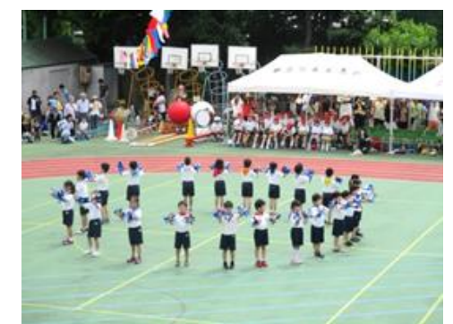
G2 “ Shararara Nanzan Star ☆”