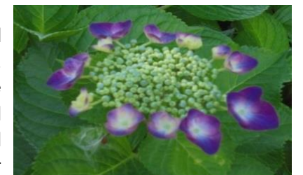
Many buds close together Hydrangea in May

Actually, there is an episode from the Science • Life Studies in-school research lessons that I attended in May that is related to hydrangeas. The lecturing teacher gave the school faculty the task, "Let's go to the schoolyard and take photos for May." The faculty made pairs, and ventured out to the corners of the Nanzan Forest and the schoolyard where they roamed while taking photos of nature in May with tablets. At the presentation afterwards, many of the faculty showed that they had taken pictures of hydrangeas with their still un-bloomed flowers. With hydrangeas, they will often catch the eye when they start to show color, but many of the faculty felt the charm of these plants in May even as the buds were still swelling in preparation to bloom.