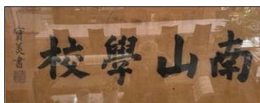
School name plaque by Sanjo Sanemi, Grand Minister of State at the time (located in the principal's office)