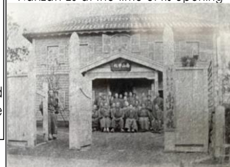
A plaque with the school name written by Sanjo Sanetomi is displayed.

The Sports Day was held on October 28. The next big event is the School Performance on December 9 (Sat). We hope that the students who perform will experience the joy of expression, including the fun of transforming into someone they are not.